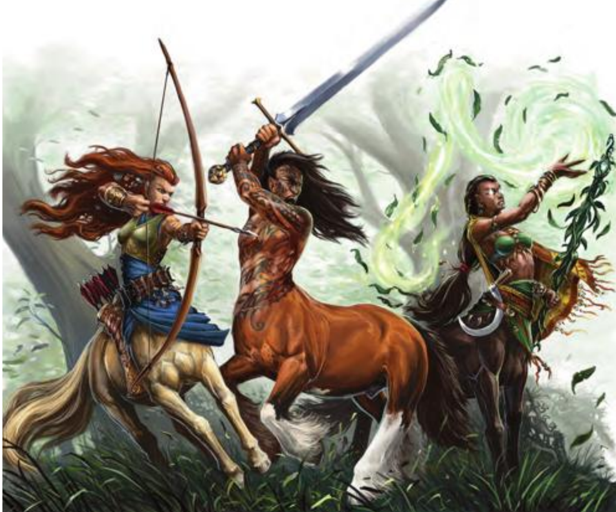
(Left to right) centaur hunter, ravager, and mystic

Nature DC 16: Centaurs revere the wild forces represented by Kord and Melora, rather than those of the fey god Corellon. Thus, they love the wild, and they fiercely protect pure lands from despoiling interlopers and monsters. They see combat and athletic contests as paths to renown, and they do not fear death in battle. Their celebrations after successful battles, hunts, or births are unruly and long, full of boasting, sport, and drink.