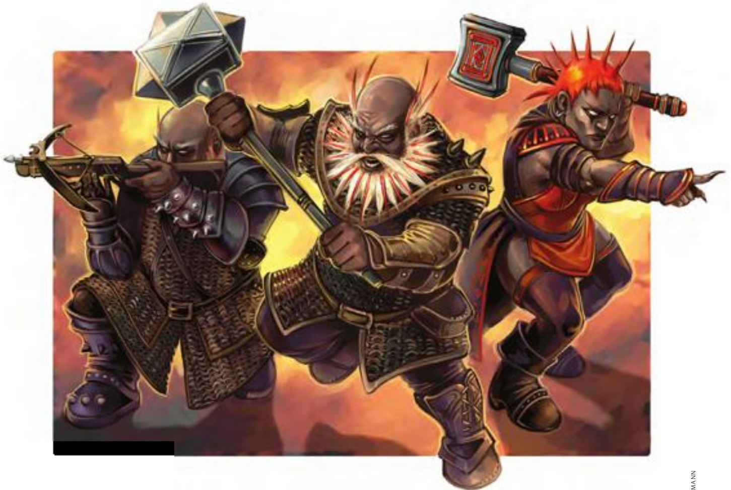
(Left to right) duergar scout, shock trooper, and theurge