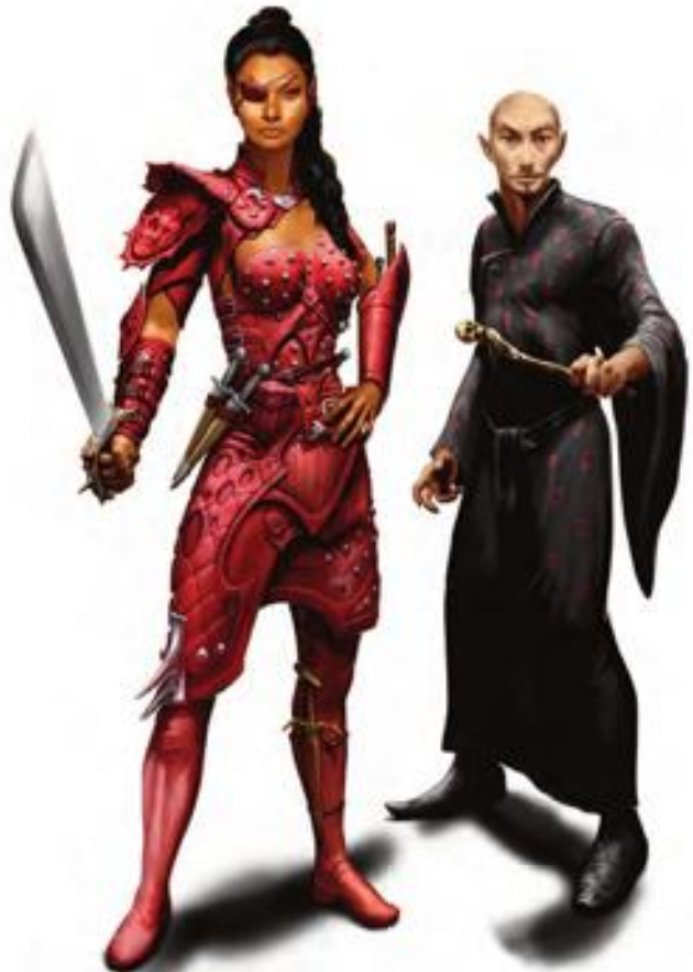
(Left to right) half-elf bandit captain and baleful thaumaturge