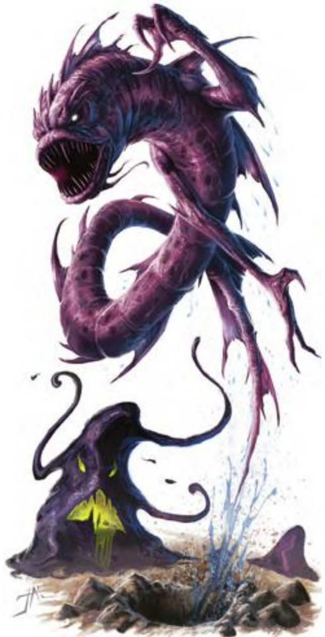
Kazrith and rupture demon