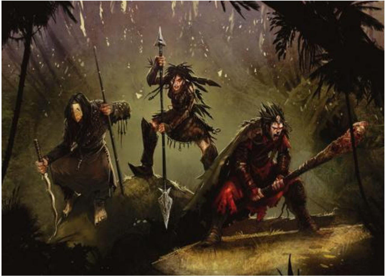
(Left to right) shrieking cultist of Demogorgon, abyssal marauder, and berserker prelate of Demogorgon

Nature DC 19: Prelates believe that, like Demogorgon, they each possess two distinct minds. One mind is a set of shackles that restrains the other wild, impulsive mind, which exults in destruction and terror.