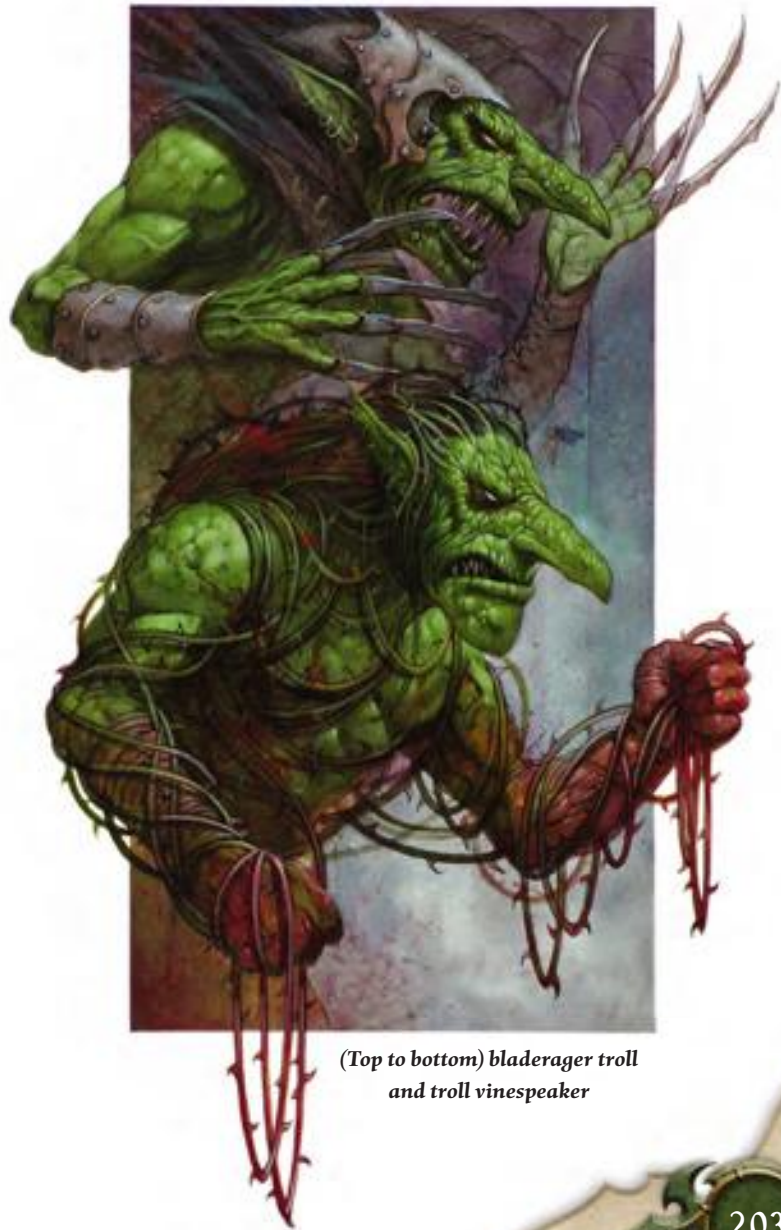
(Top to bottom) bladerager troll and troll vinespeaker