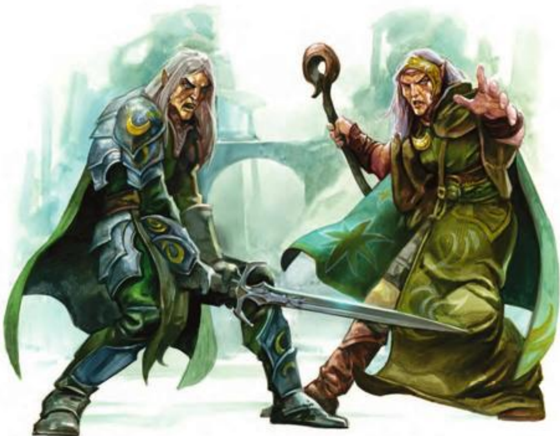
Lingerer knight and fell incanter