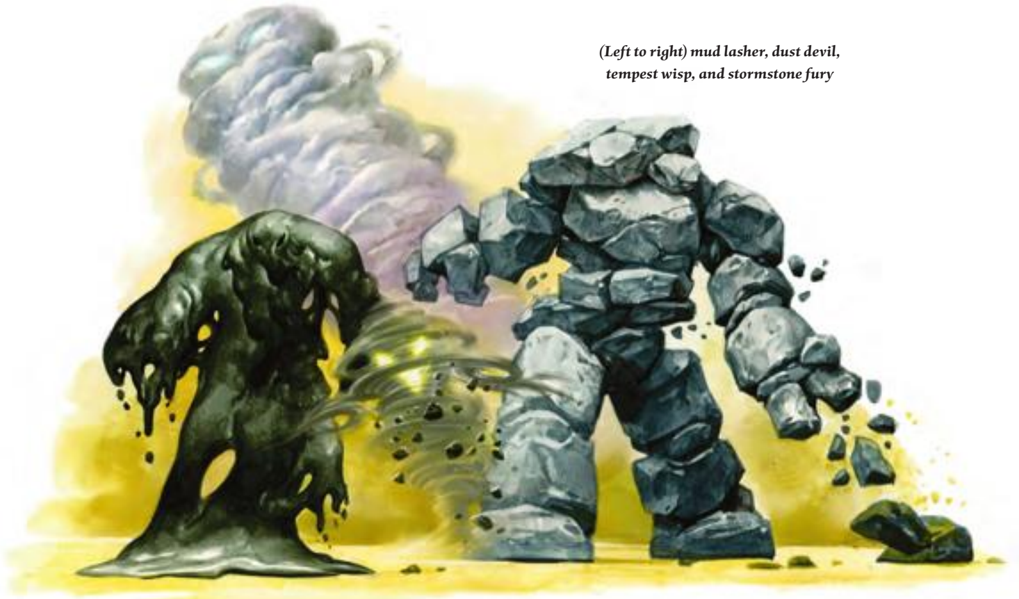
(Left to right) mud lasher, dust devil, tempest wisp, and stormstone fury