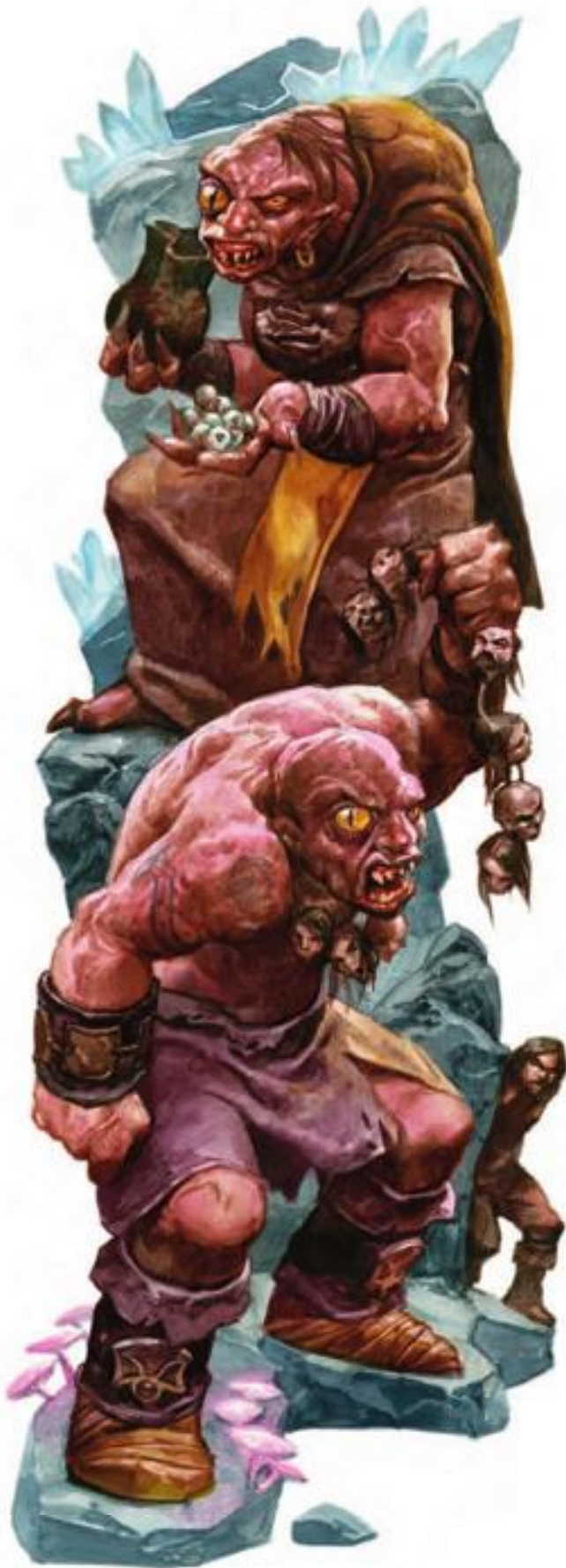
(Top to bottom) fomorian blinder and totemist