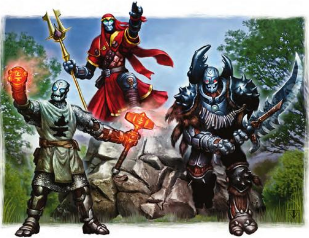
(Left to right) warforged anvilpriest, warforged resounder, and warforged savage