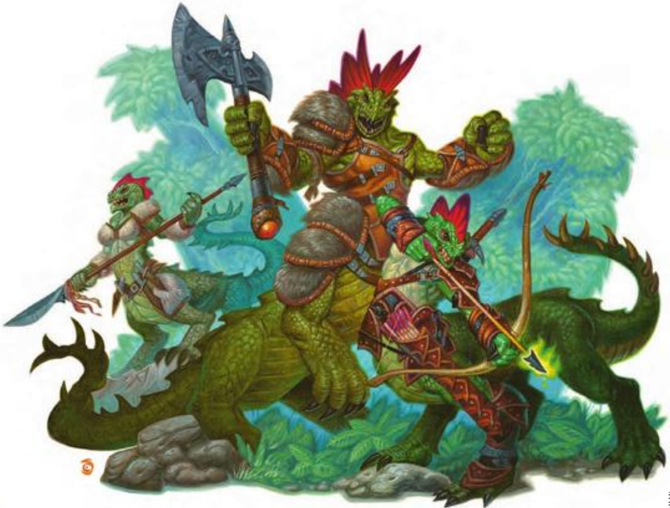
(Left to right) drakkoth ambusher, rager, and venomshot