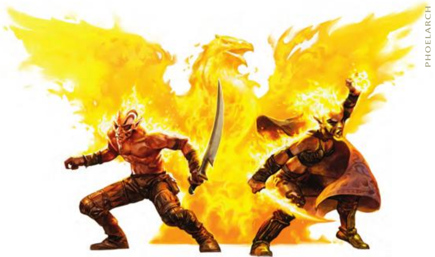
(Left to right) phoelarch warrior, phoera, and phoelarch mage