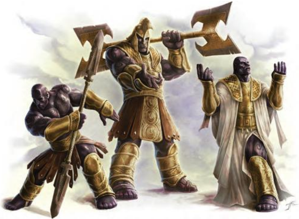
(Left to right) marut castigator, executioner, and prosecutor