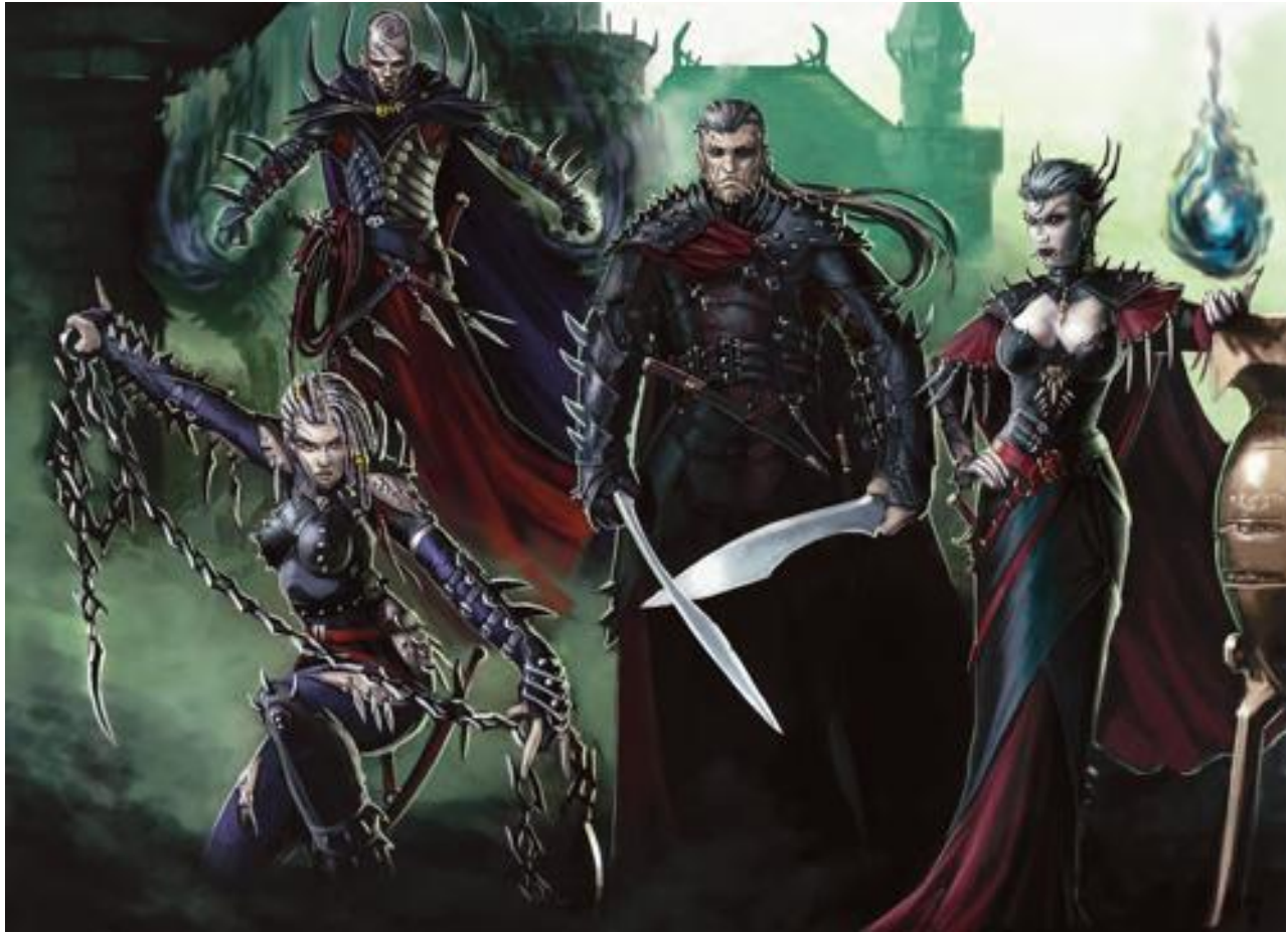
(Left to right) shadar-kai painbearer, gloom lord, dawnkiller, and blacksoul