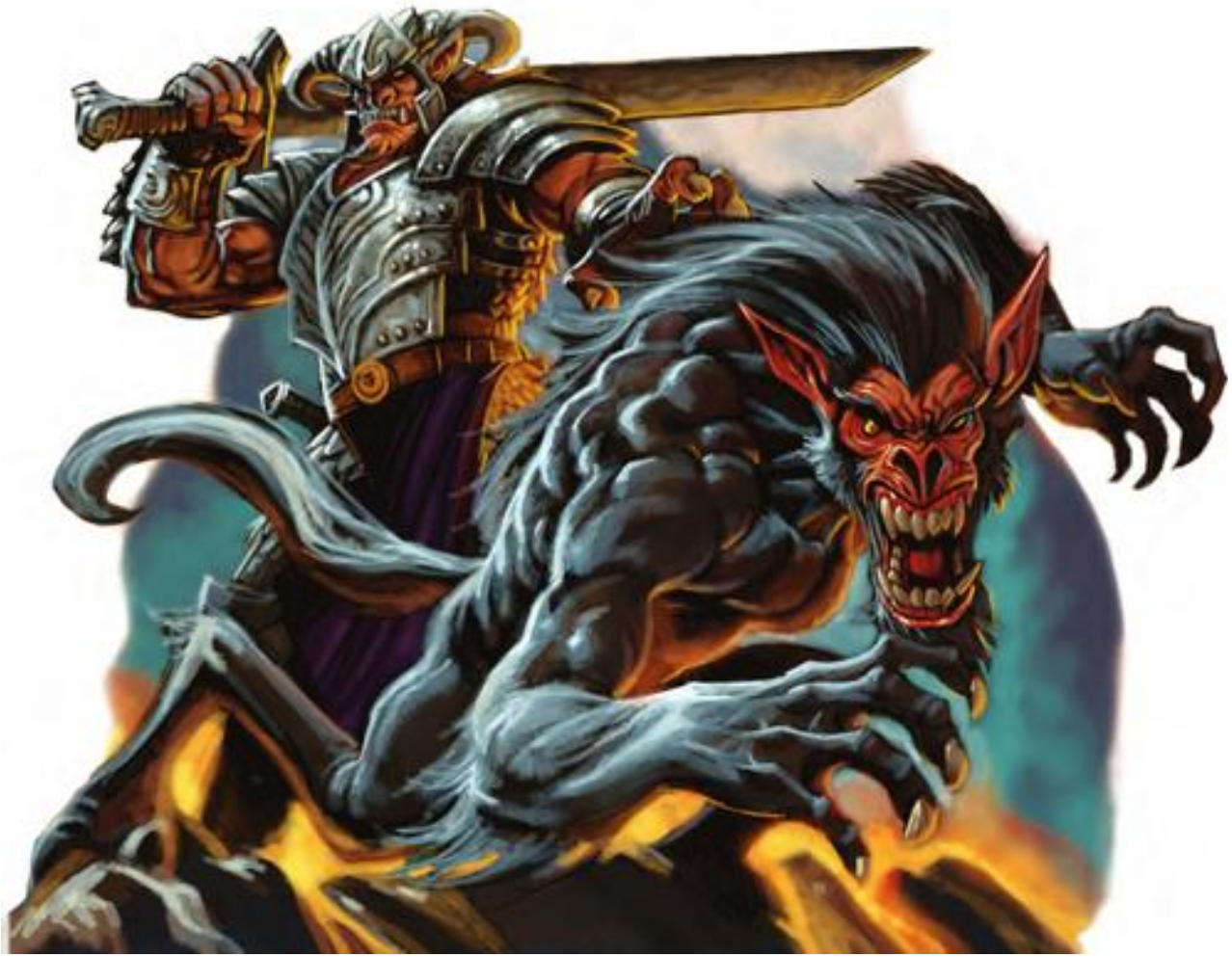
Barghest battle lord in hobgoblin form and in wolf form