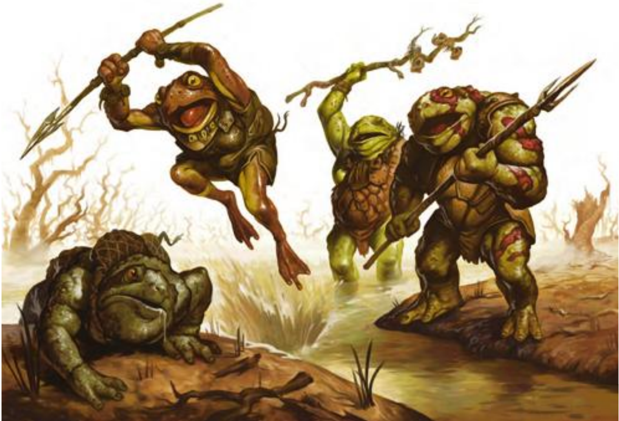
(Left to right) bullywug croaker, twitcher, mud lord, and mucker