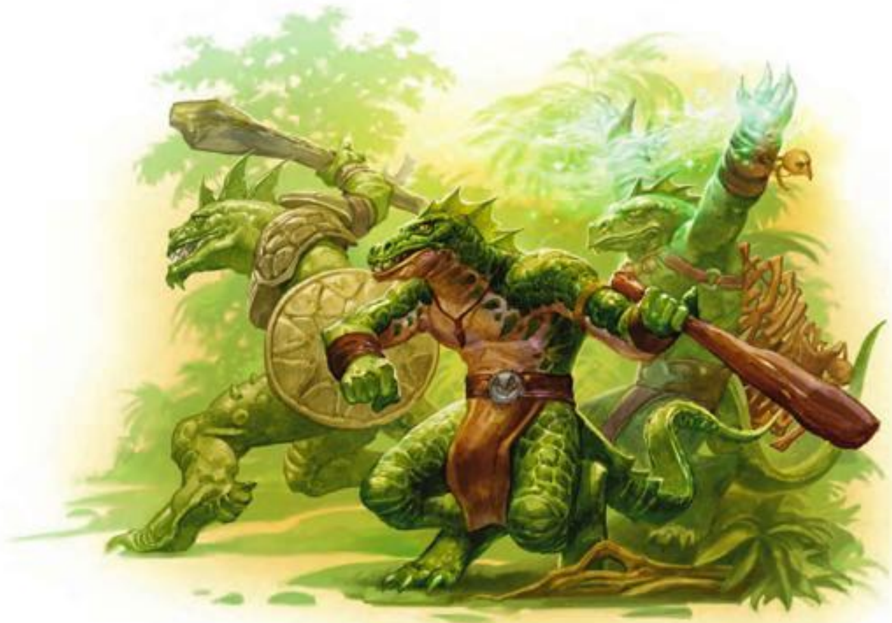
(Left to right) poison scale myrmidon, savage, and magus