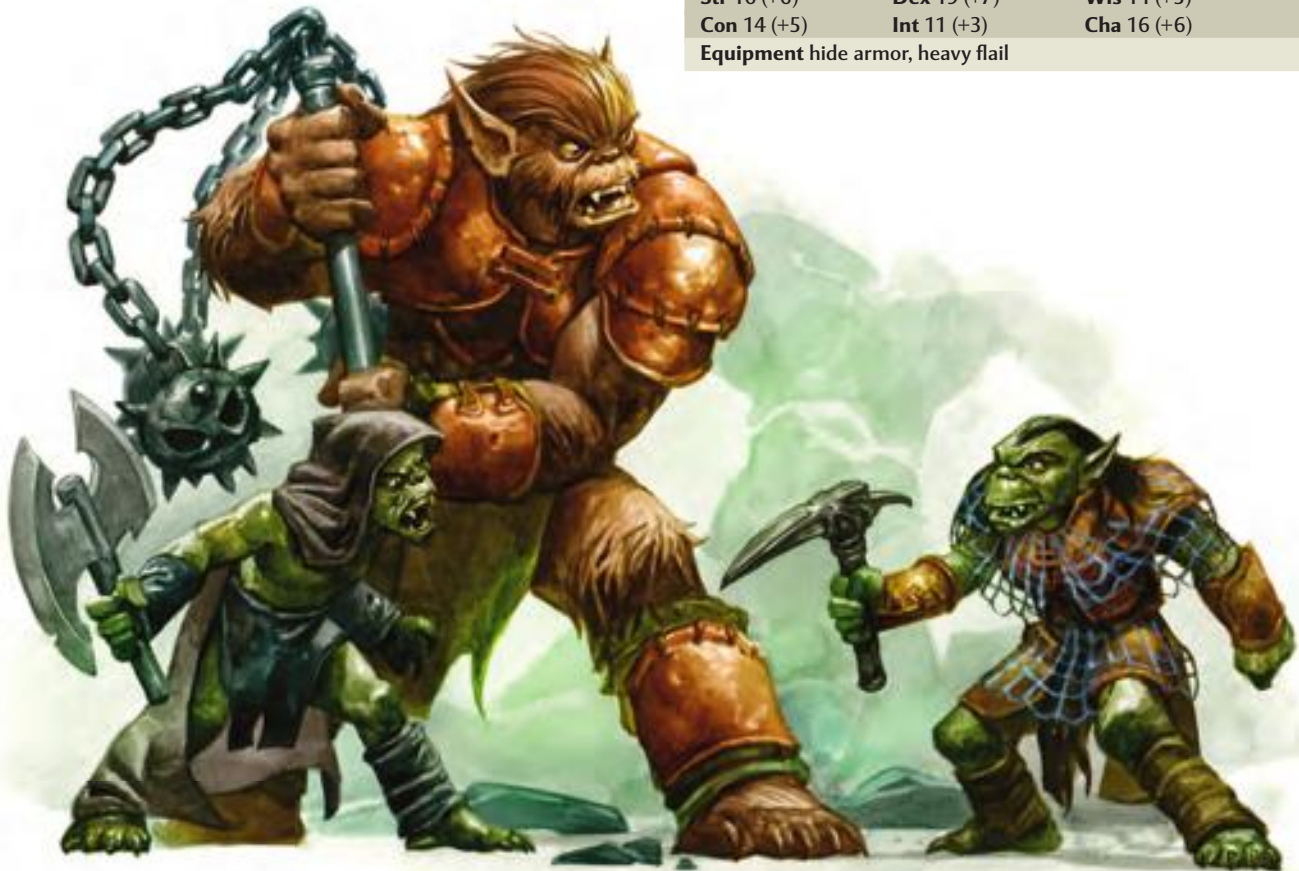
(Left to right) goblin acolyte of Maglubiyet, bugbear wardancer, and Lolthbound goblin