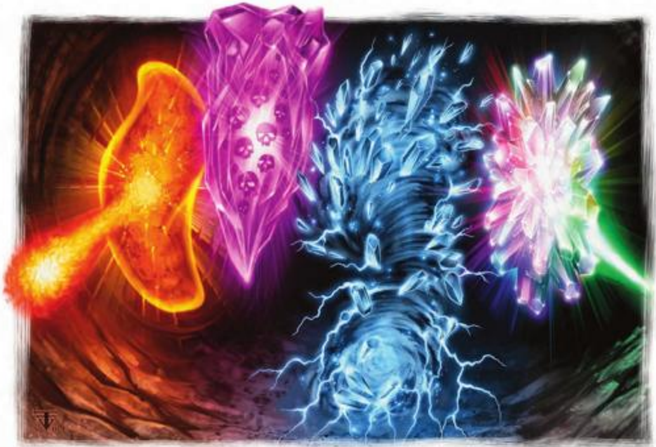
(Left to right) flame shard, death shard, storm shard, prismatic shard