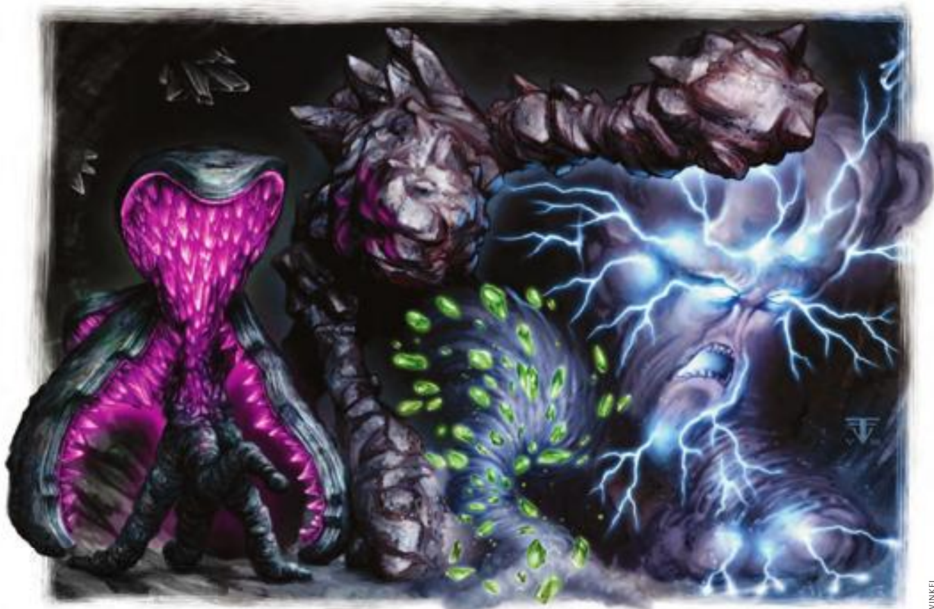
(Left to right) geonid, rockfist smasher, shardstorm vortex, and windfiend fury

The windfiend fury teleports to any space adjacent to the burst's area of effect.