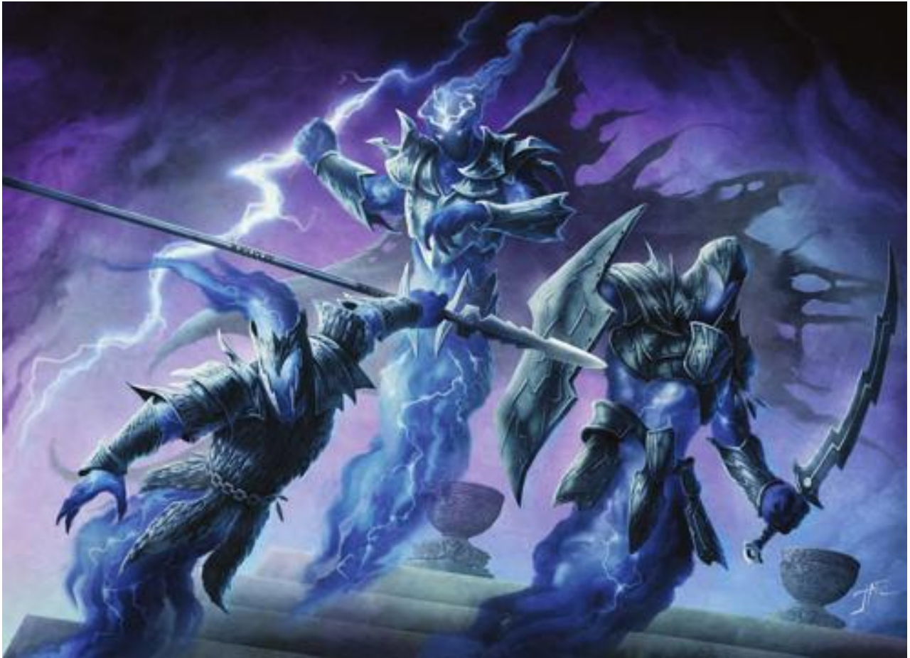
(Left to right) storm archon lightning walker, tempest weaver, and squallshield