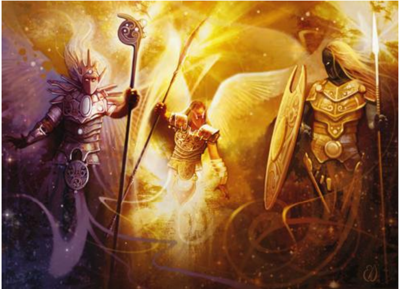
(Left to right) angel of authority, angel of light, and angel of supremacy