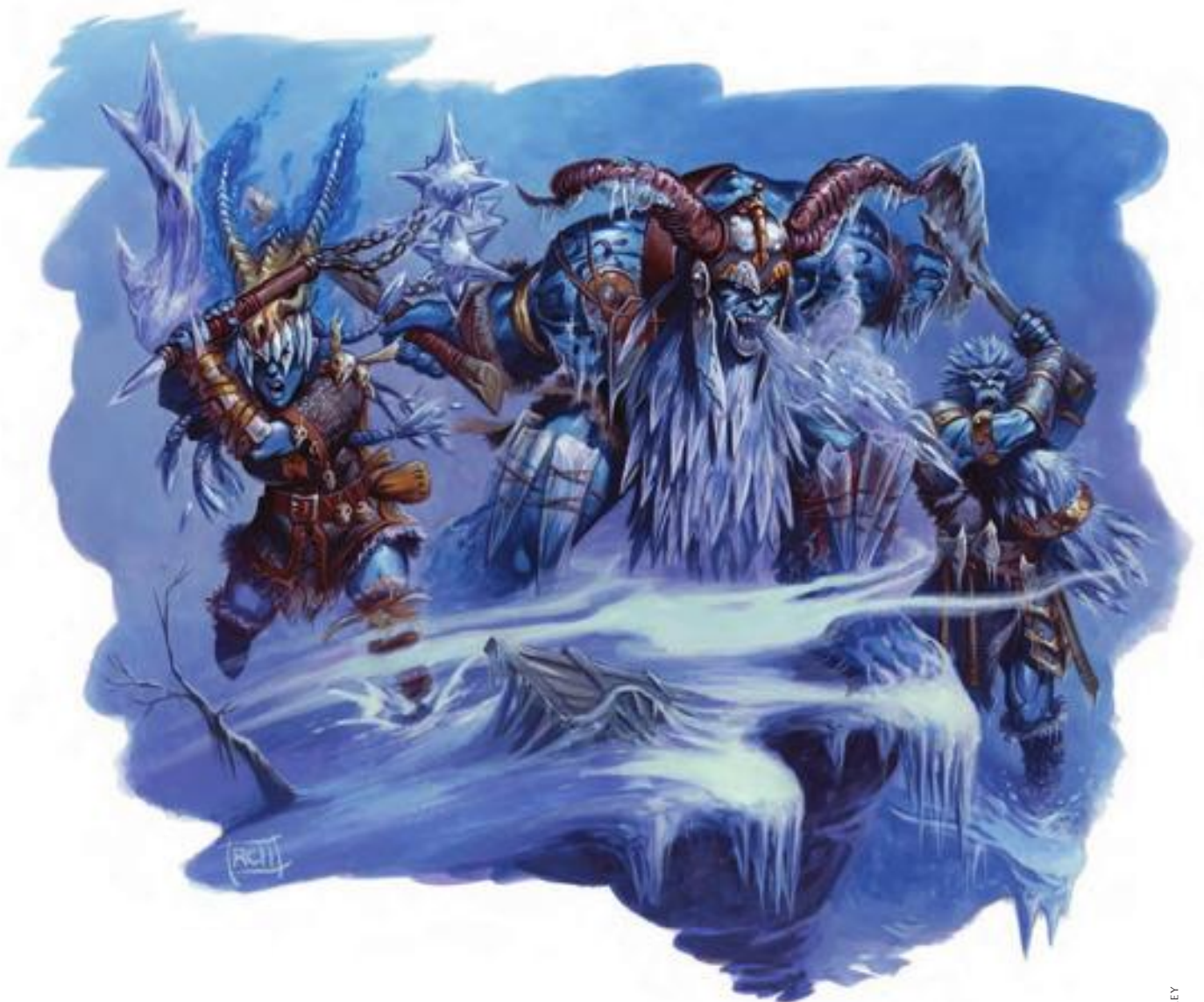
(Left to right) frost giant ice shaper, frost titan, and frost giant

A frost giant prefers to charge into melee with an icy greataxe attack. It follows up with chilling strike . It throws an icy handaxe only when it has no other options.