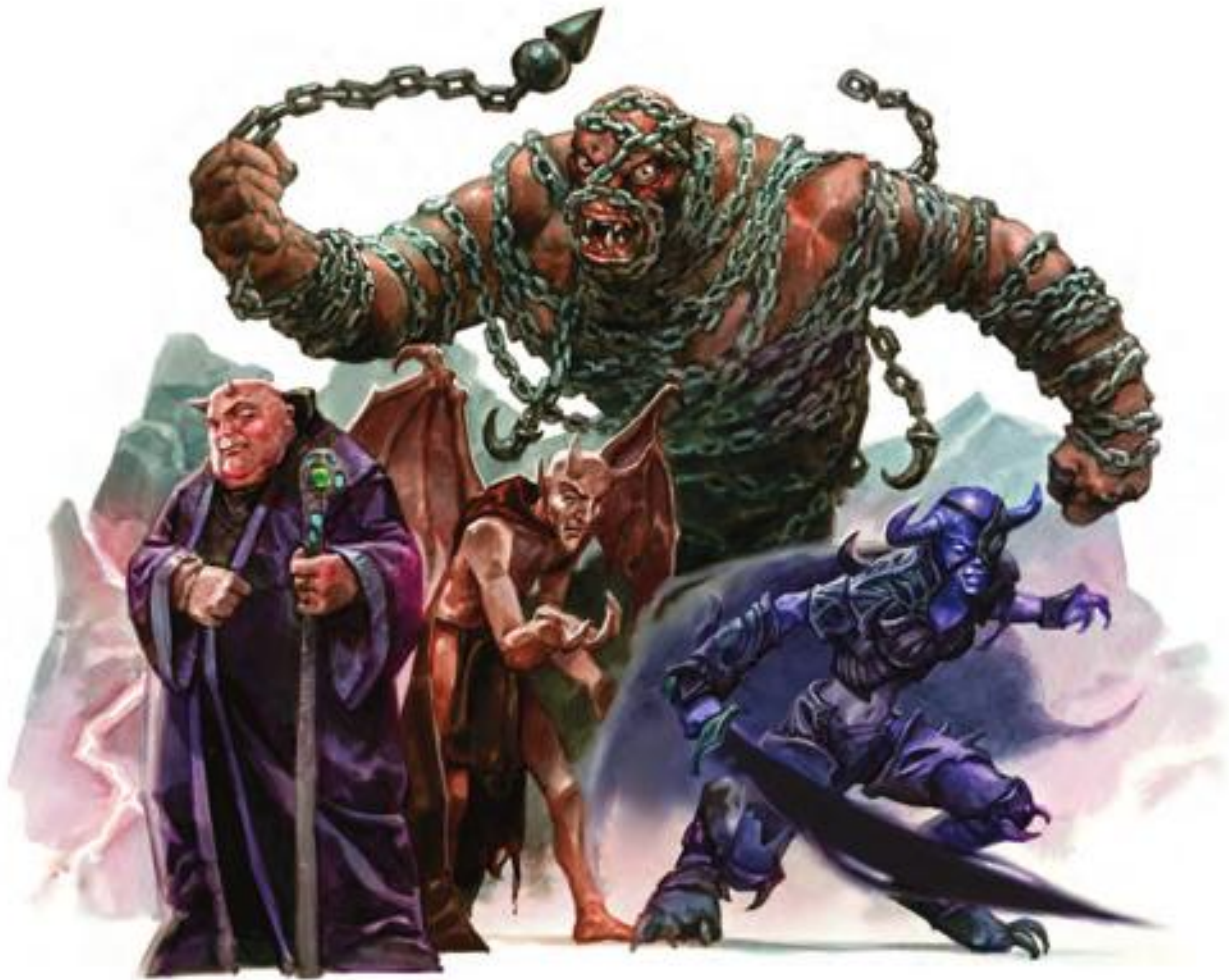
(Left to right) misfortune devil, withering devil, gorechain devil, and assassin devil