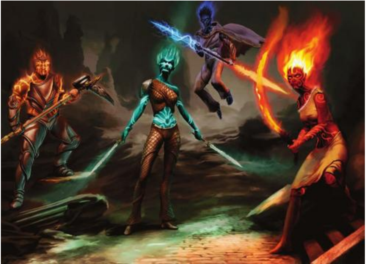
(Left to right) genasi stoneshield, skyspy, elemental dervish, and fireblade