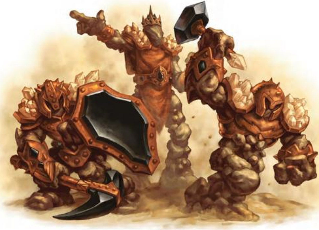
(Left to right) earth archon seismic striker, ground rager, and rumbler