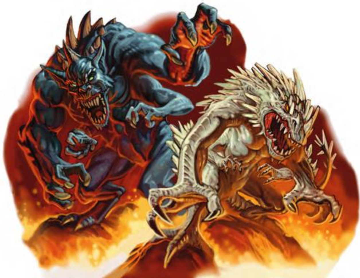
(Left to right) abyssal eviscerator and bloodseep demon