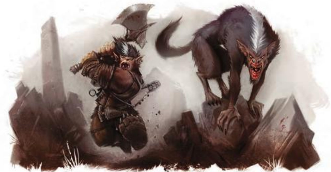
Barghest savager in bugbear form and in wolf form

Aftersave: The target takes a -2 penalty to attack rolls (save ends).