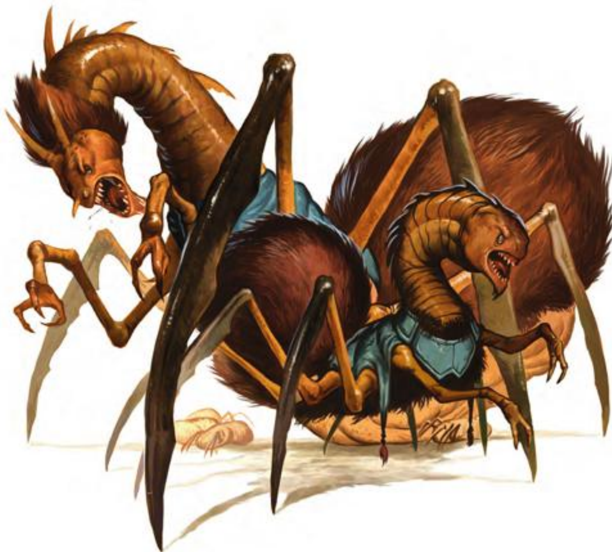
(Back to front) neogi great old master and neogi slaver