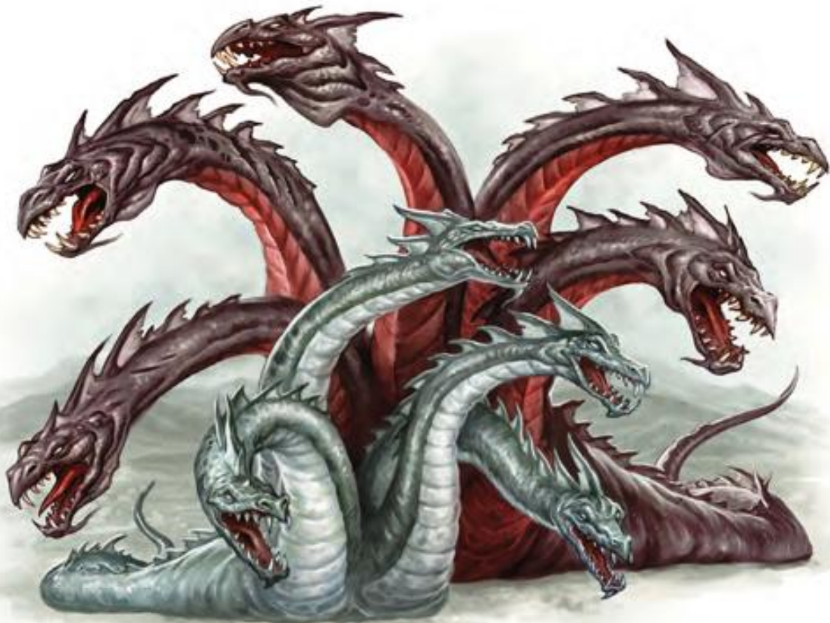
(Back to front) heroslayer hydra and razor hydra

A CREATURE OUT OF LEGEND, the heroslayer hydra earned its name from the heroes who fell to its fangs.