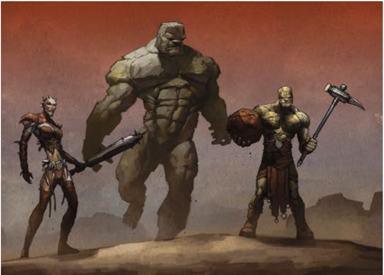
(Left to right) stone giant, stone titan, and stone giant runecarver