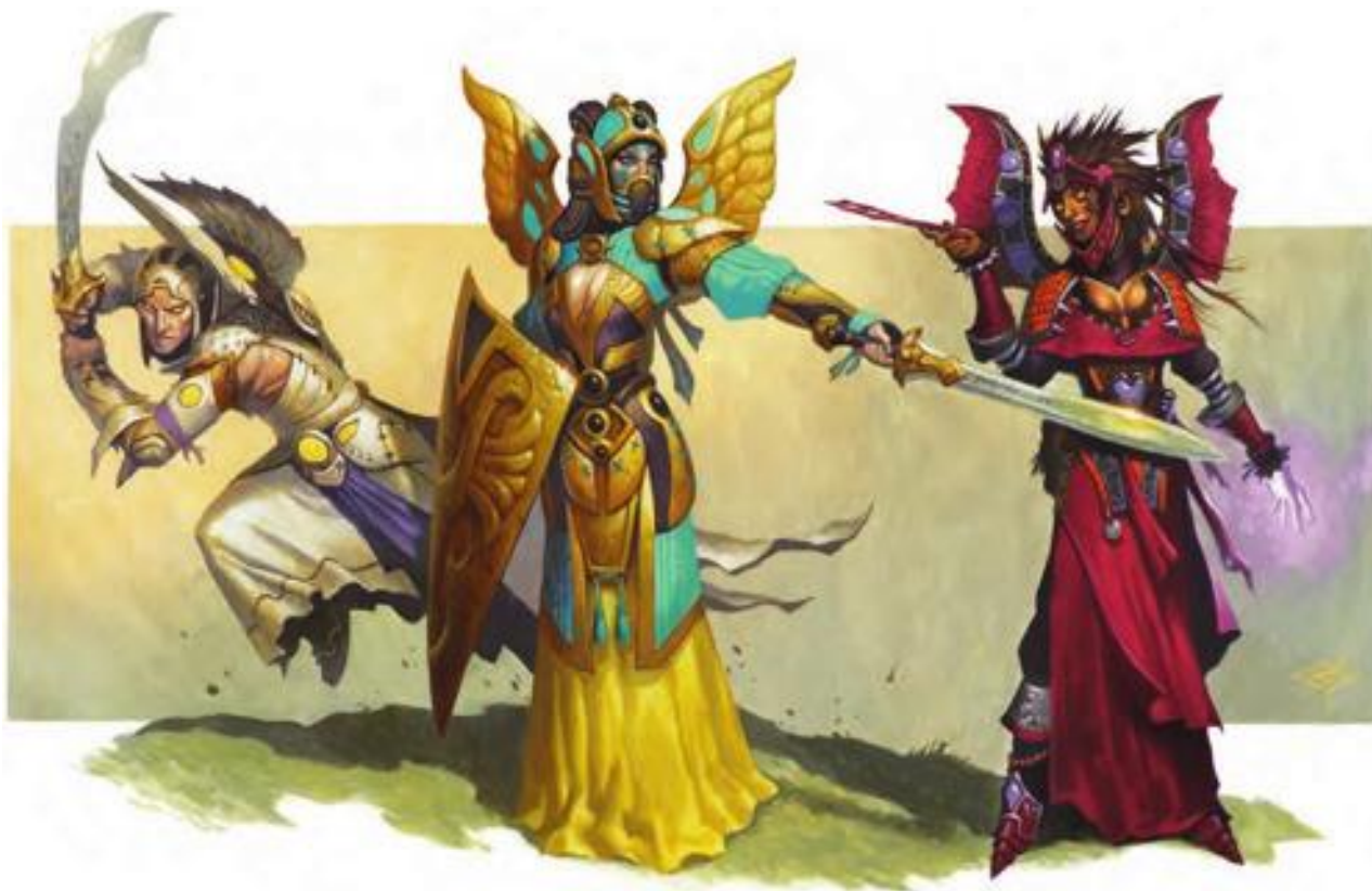
(Left to right) deva zealot, deva knight-errant, and deva fallen star

✧ Fateful Transposition (immediate interrupt, when an enemy attacks the deva fallen star; encounter) ◆ Teleportation Ranged 10; +31 vs. Will; the target swaps positions with the deva fallen star. The triggering enemy's attack deals half damage to the fallen star, and the target takes damage equal to half the attack's damage.