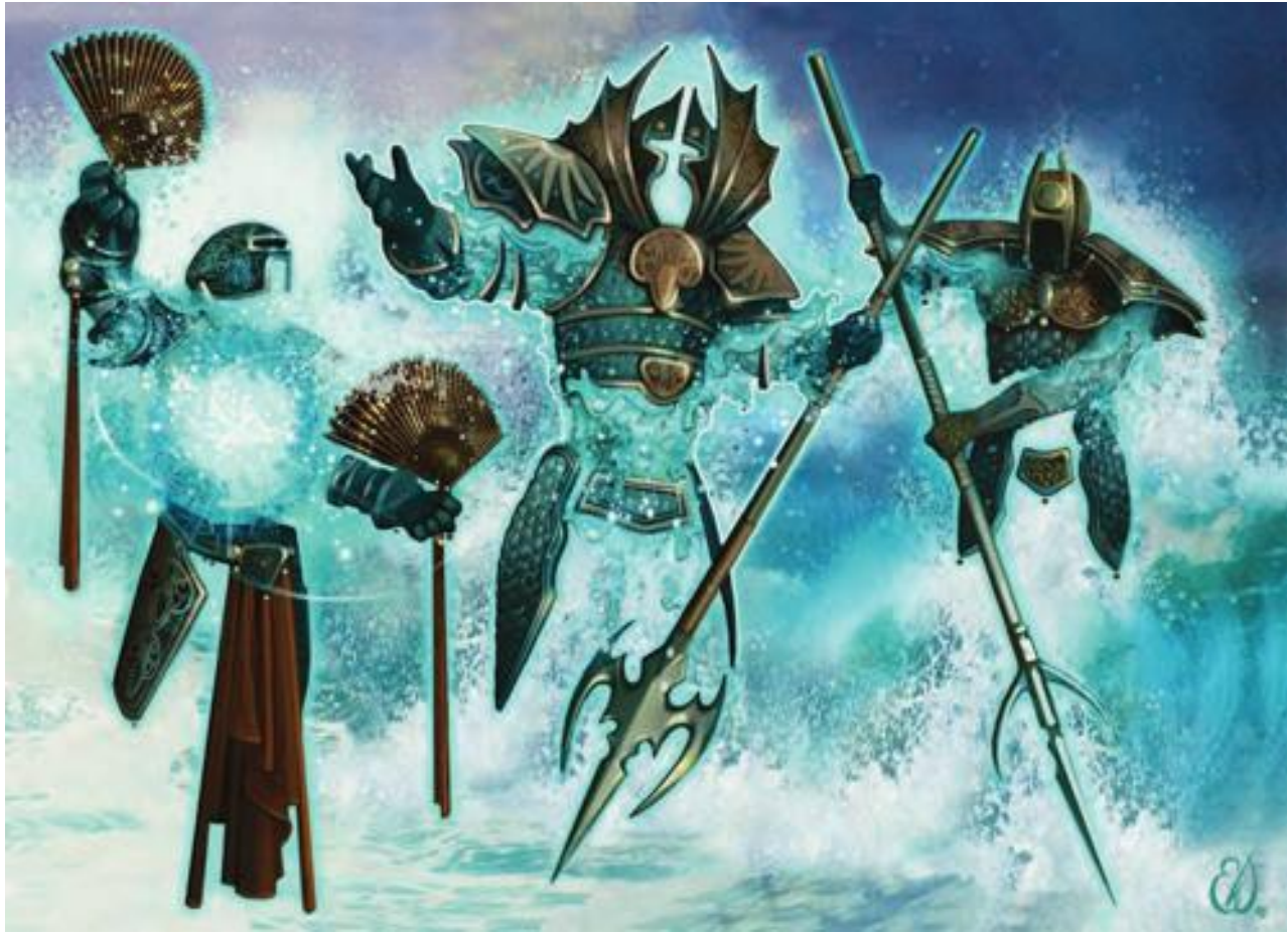
(Left to right) water archon waveshaper, shoal reaver, and tide strider