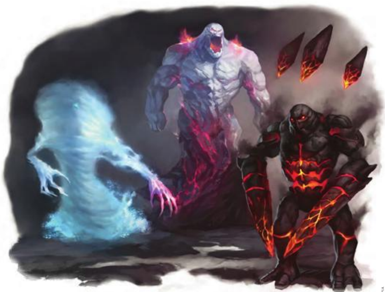
(Left to right) windstriker, chillfire destroyer, and flamespiker

Arcana DC 18: A chillfire destroyer combines the power of fire with the strength of elemental ice. This dangerous mix results in a deadly explosion when the creature is slain. Both fire archons and ice archons seek to recruit chillfire destroyers for their forces, sometimes coming into conflict as a result.