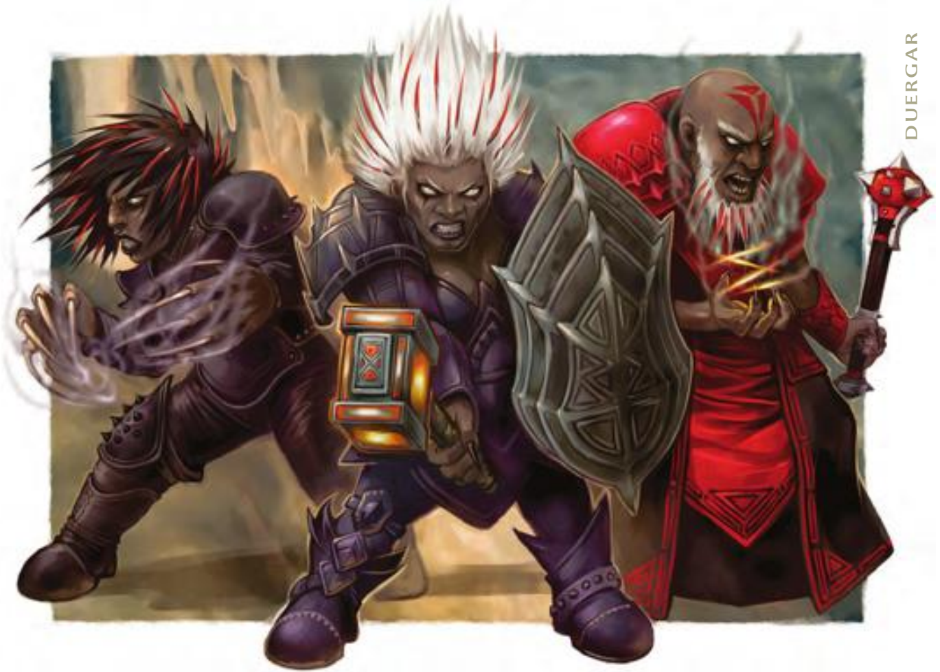
(Left to right) duergar fleshtearer, blackguard, and hellcaller