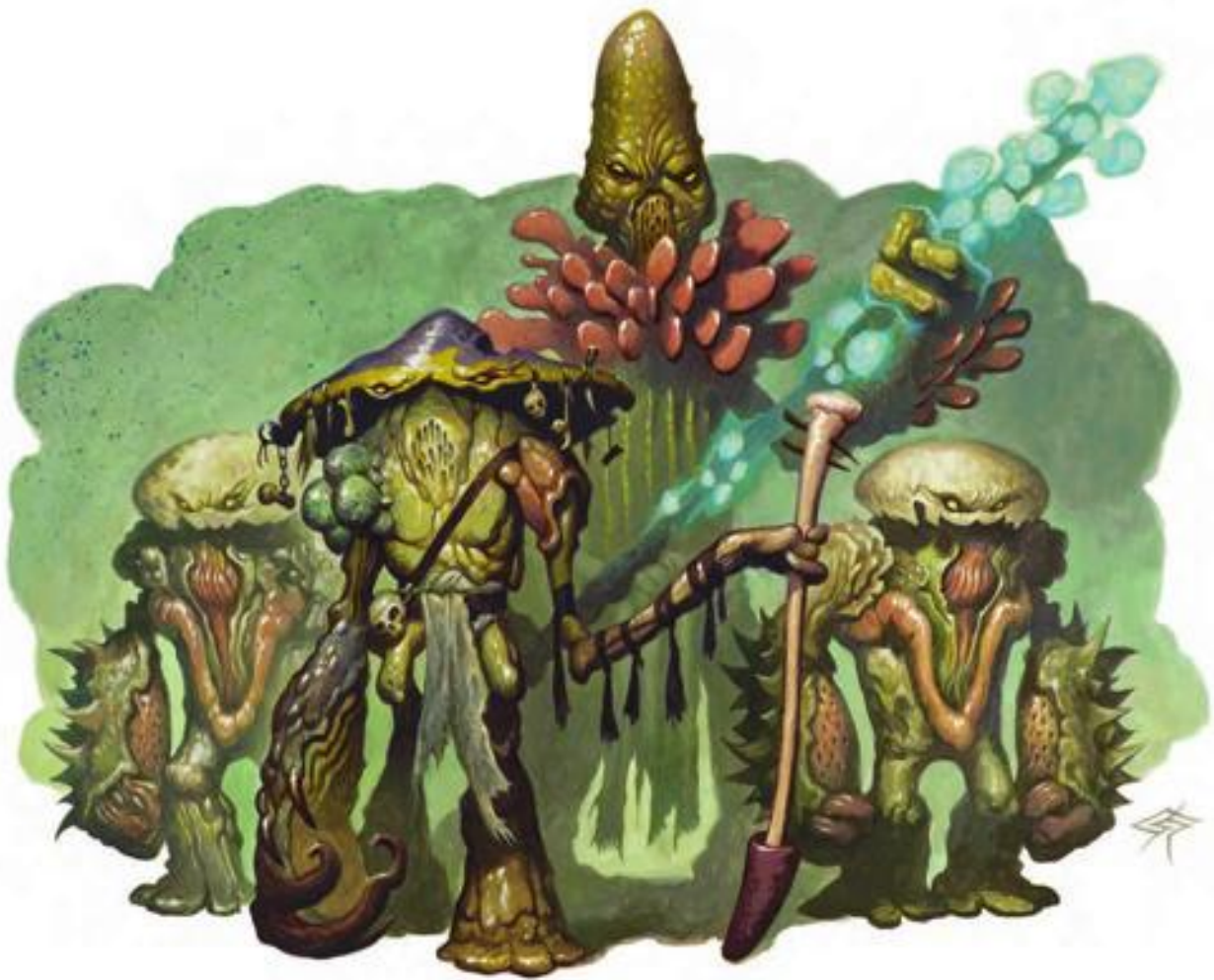
(Left to right) myconid guard, rotpriest, sovereign, and guard