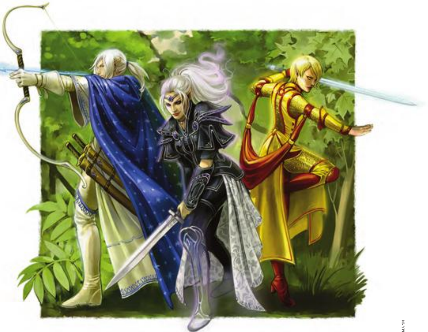
(Left to right) eladrin arcane archer, cour of mischief and strife, and bladesinger

Arcana DC 17: Arcane archery is more than just a combination of magic and skill at arms. It is a complete fusion of two arts, its secrets known only to the eladrin.