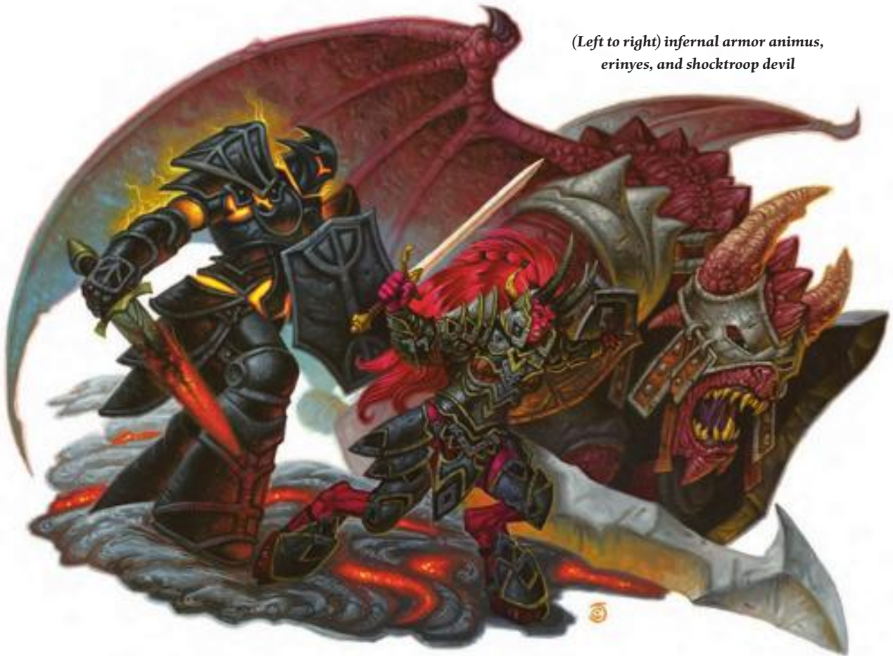
(Left to right) infernal armor animus , erinyes , and shocktroop devil