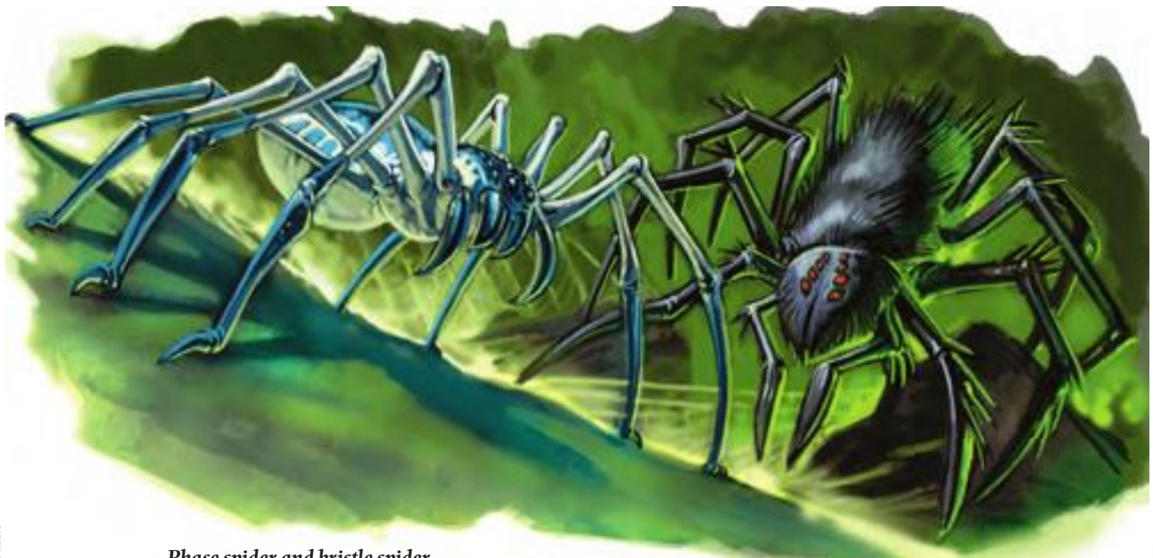
Phase spider and bristle spider