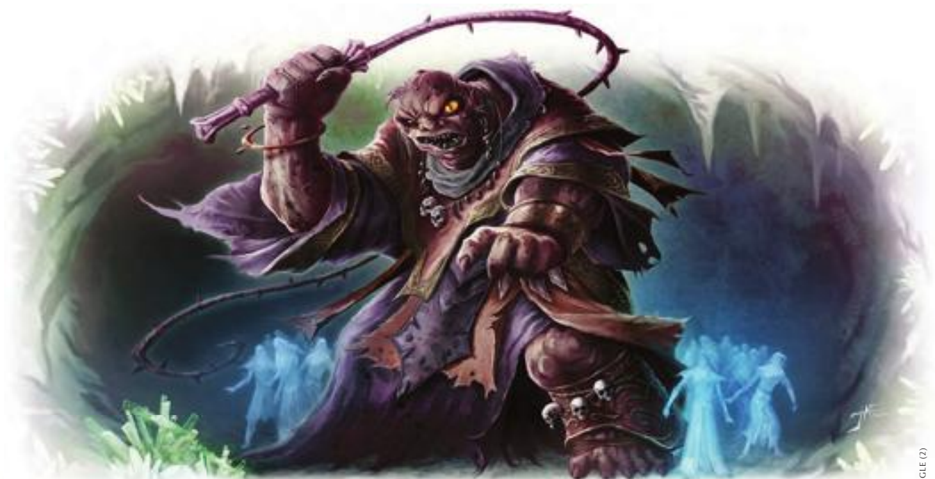
Fomorian ghost shaman

Ranged 5; +20 vs. Will; the target treats the fomorian cackler as invisible (save ends).