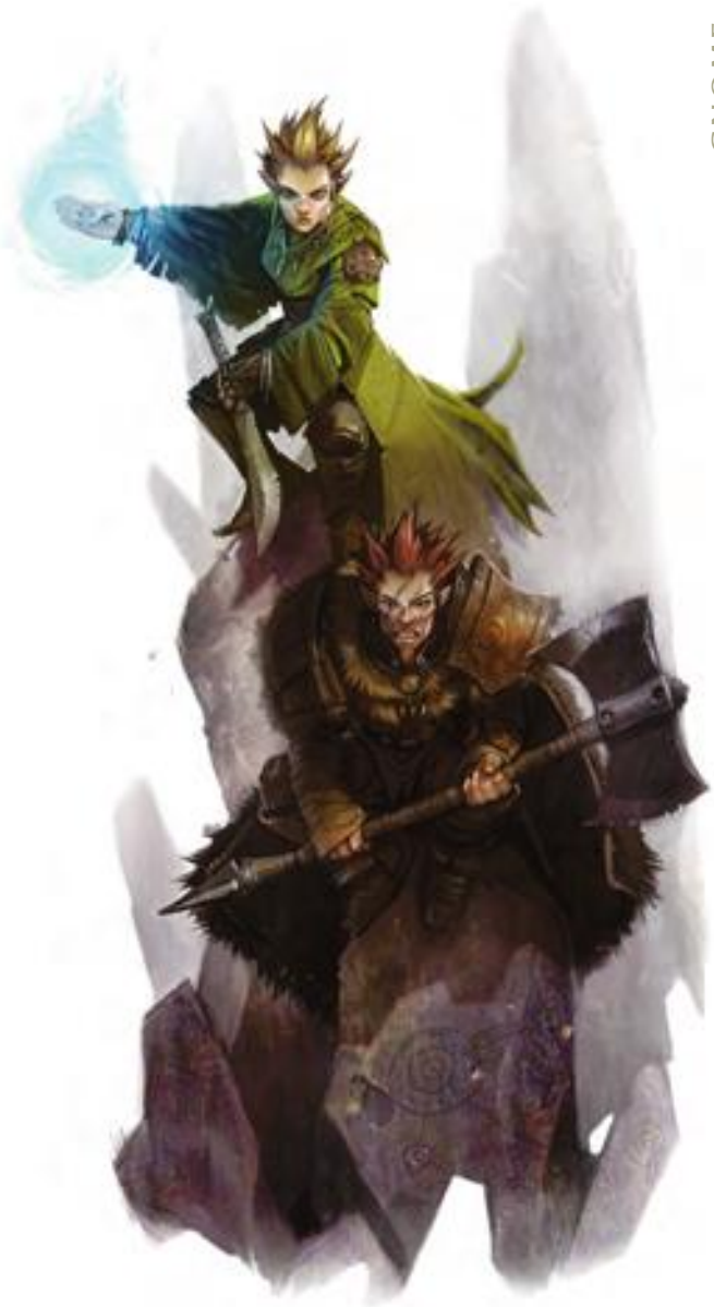
(Top to bottom) gnome entropist and wolverine

Nature DC 14: A gnome wolverine has a fierceness that belies the stature and reputation of its race. A berserker fury drives a wolverine in battle, and its power increases with each foe it drops.