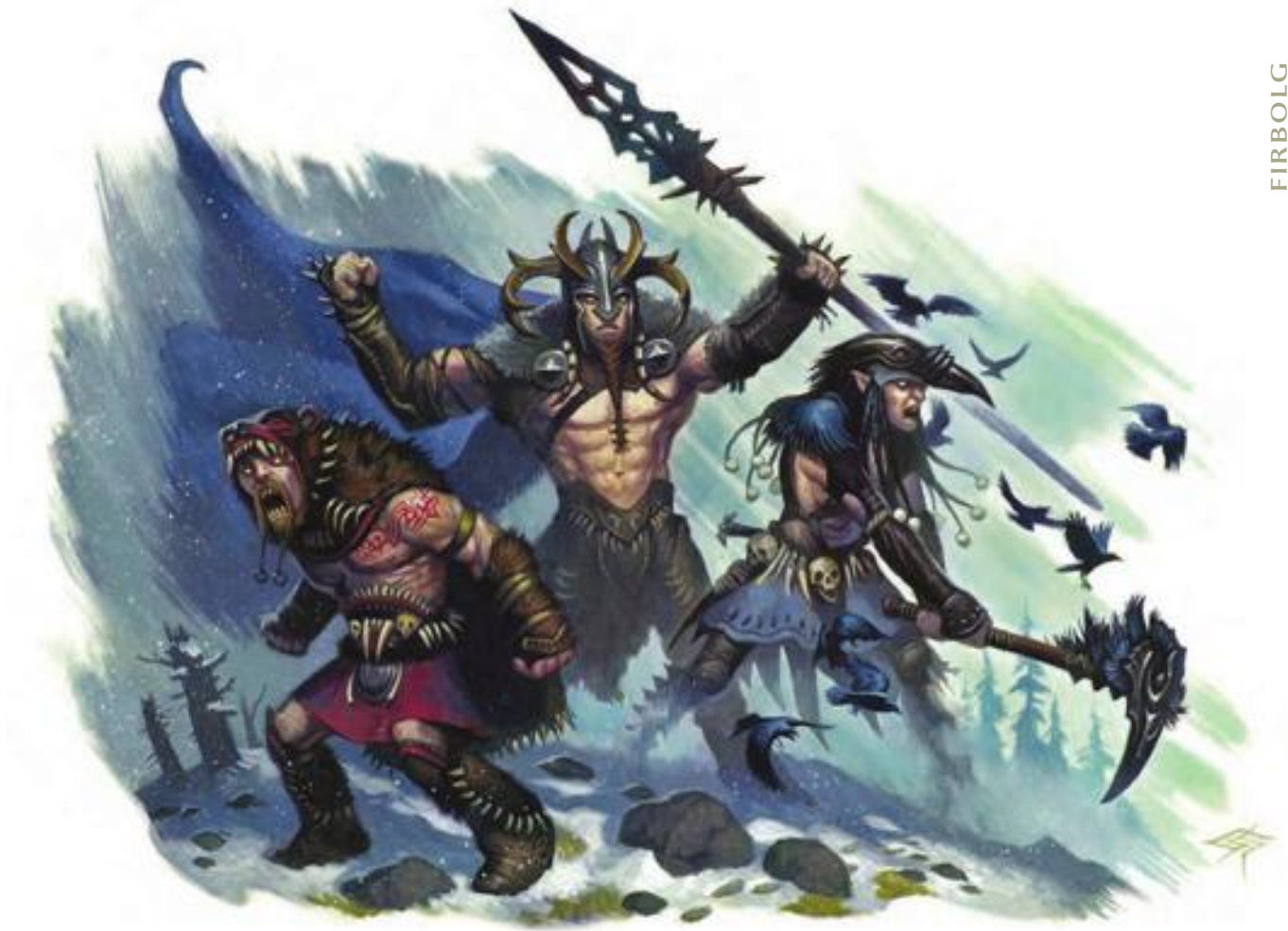
(Left to right) firbolg bloodbear, master of the Wild Hunt, and ghostraven