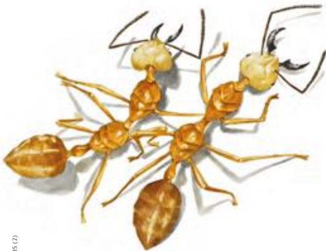
JEREMY JARVIS (2)