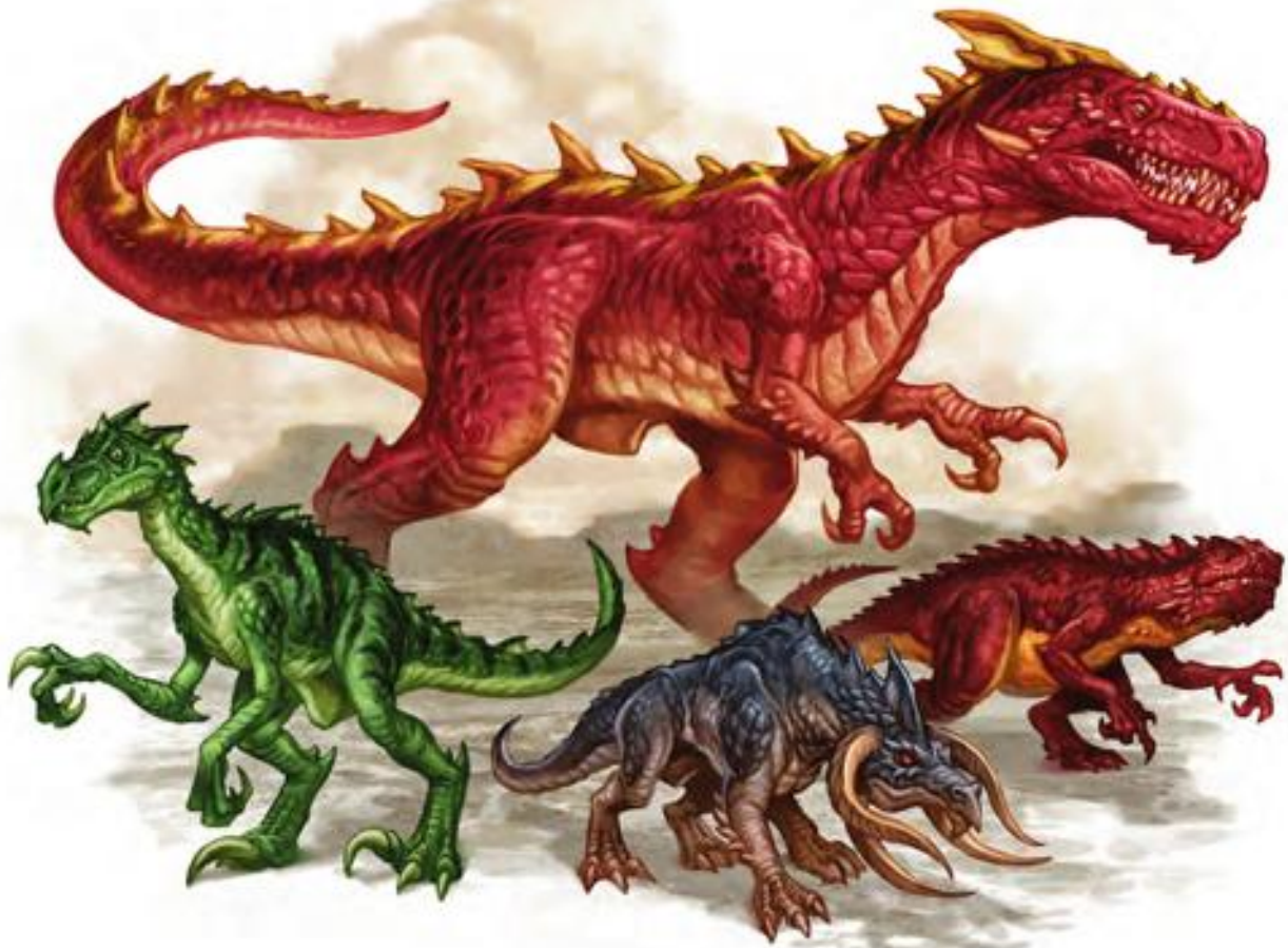
(Left to right) scytheclaw drake, fang titan drake, horned drake, and bloodseeker drake