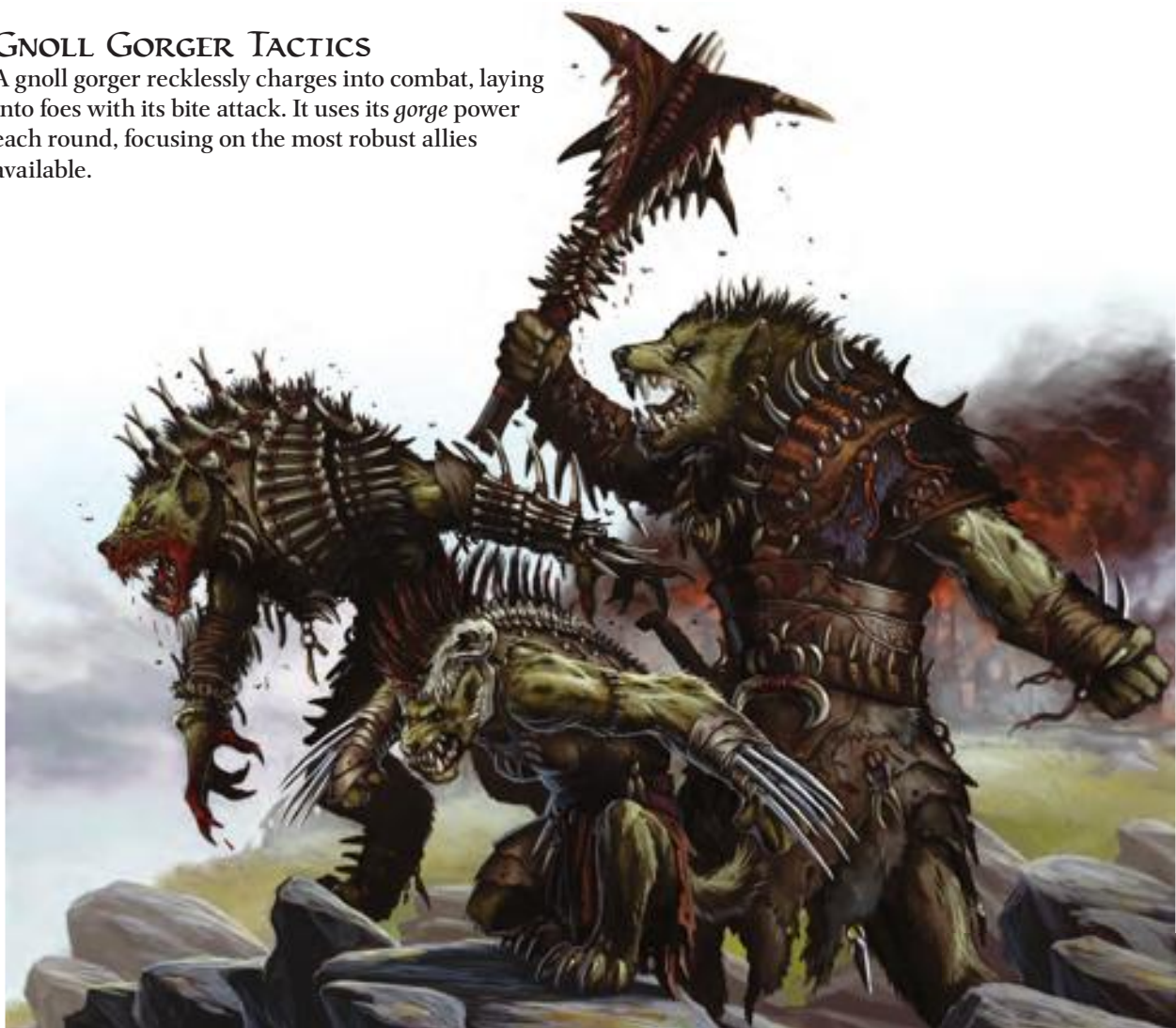
(Left to right) gnoll gorger, deathpledged, fang of Yeenoghu