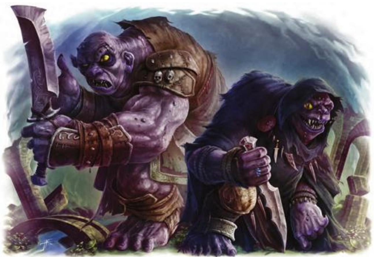
(Left to right) fomorian butcher and cackler